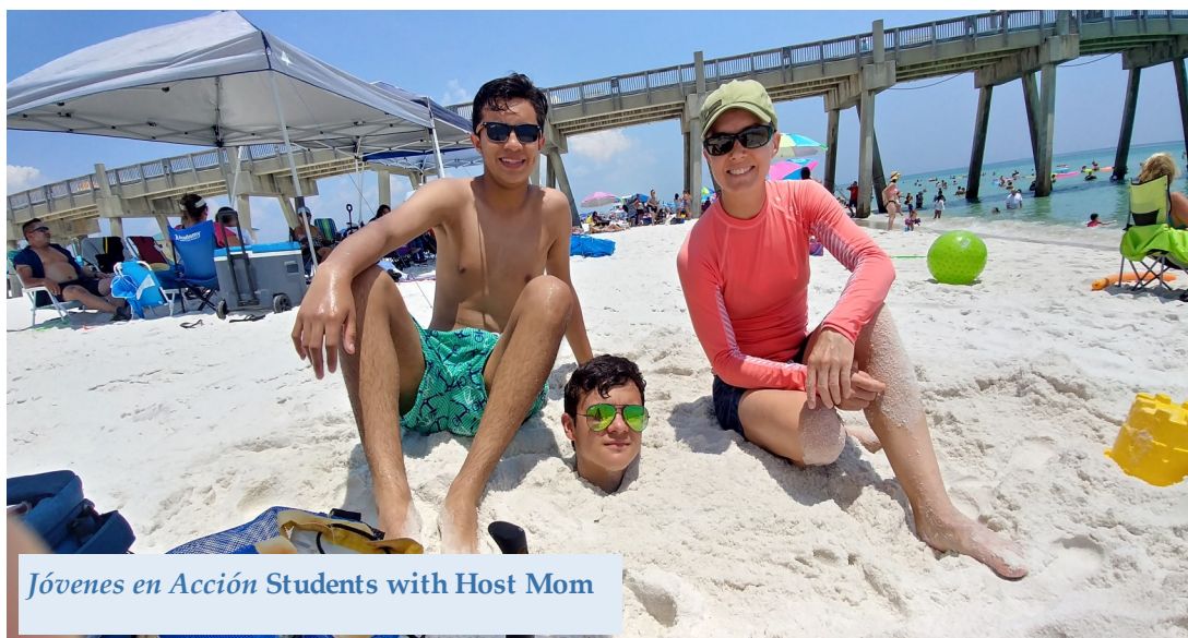
Jóvenes en Acción Students with Host Mom