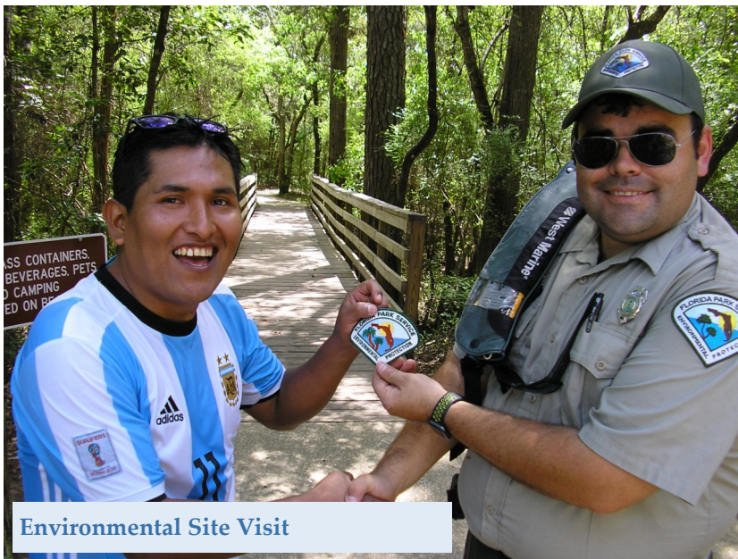
Environmental Site Visit

We partnered with 4-H, Feeding the Gulf Coast, the Florida Department of Environmental Protection, Manna Food Pantries, Ocean Hour, and Serving the Hungry at First United Methodist Church to coordinate 19 volunteer activities for visitors and four for the Youth Diplomats.