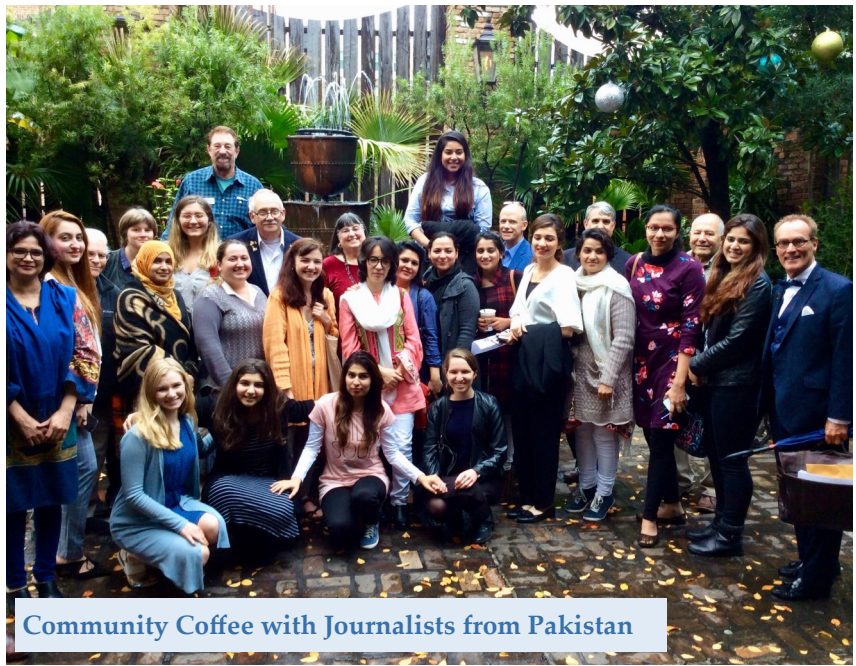
Community Coffee with Journalists from Pakistan

We offered 15 community coffees, four mixers, a summer party for Young Professionals, a potluck, and two additional receptions. We also celebrated our 10 year anniversary, hosted a book club evening, arranged for members to