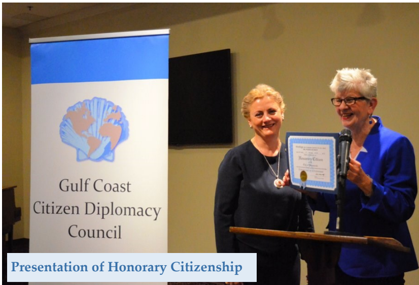
Presentation of Honorary Citizenship

join visitors at Winterfest, and co-hosted a Careers Representing America networking event with the U.S. Department of State's Diplomat-in-Residence. Members welcomed 64 professionals into their homes for meals. We joined groups at Bands on the Beach and took them sailing. All visitors & interpreters received honorary citizenship with the City of Pensacola.