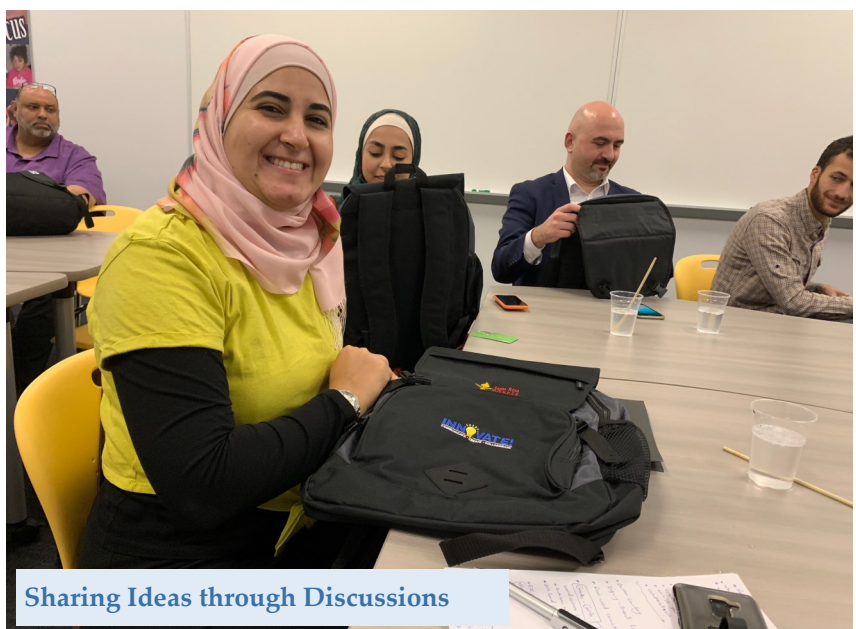
Sharing Ideas through Discussions