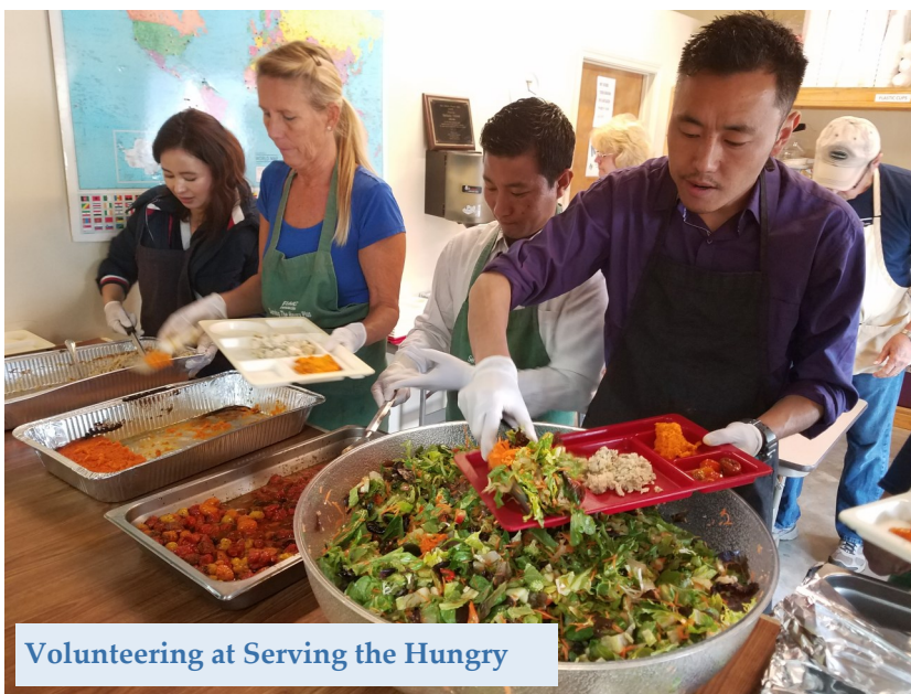
Volunteering at Serving the Hungry

join visitors at Winterfest, and co-hosted a Careers Representing America networking event with the U.S. Department of State's Diplomat-in-Residence. Members welcomed 64 professionals into their homes for meals. We joined groups at Bands on the Beach and took them sailing. All visitors & interpreters received honorary citizenship with the City of Pensacola.